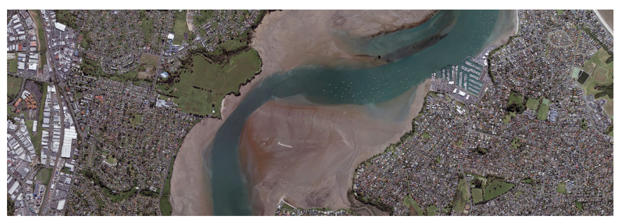
The Tamaki Estuary (low tide)

The Productivity Commission's latest report on how to improve urban planning suggests the development of Regional Spatial Strategies (RSSs) and Regional Policy Statements for the Natural Environment (RPS-NE) to work out land-use parameters and set protective limits for the natural environment. I think this is a great idea. A specific plan for how many shorebirds we want in the Tāmaki Estuary, what species and where they can breed would really help. As I illustrated in my submission the current trend towards no shorebirds in the next decade would be a disaster. It would also be good to plan a network of dotterel breeding habitat around the city. Providing adequate space in proximity to feeding grounds should help to prevent development/dotterel conflicts in future. With better management we could dramatically increase the shorebird populations, we could then take them off the endangered lists, and not be so concerned if we want to destroy their habitat. You haven't heard a word from me about the skylark, pukeko, pheasant and other common birds at Point England because they are just that 'common'.