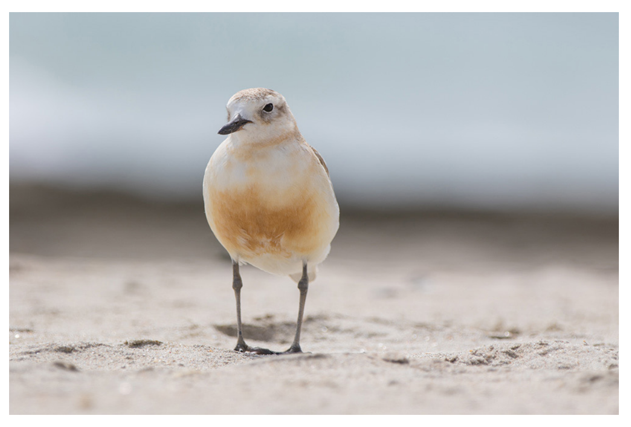
Northern New Zealand dotterel on an Auckland beach

Aucklanders are used to seeing dotterel on beaches, as around 90% of our 2,200 Northern New Zealand dotterel breed on beaches. But with sea levels predicted to rise 50-100 cm this century that's not good news for this species. What we are learning from managing dotterel at elevated sites like Point England is critical to the survival of this species in the decades ahead.