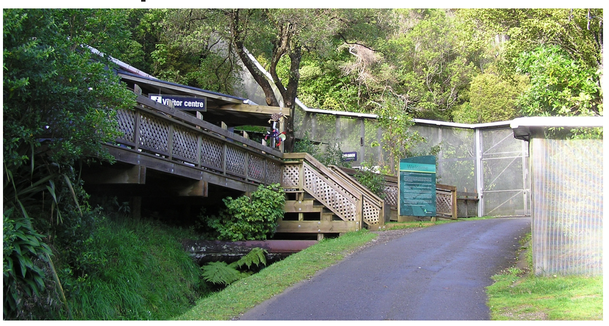
The first predator proof fence at Karori Wildlife Sanctuary (2007).

I think that you could significantly reduce the development area and add a few houses at Point England and at the same time create better habitat for the birds. I just don't see it happening under the current process. It's not just the money required to do the right thing for the birds, but the time it will take to do the experiments properly. You would need to invest in: cat-free houses, enforcement of that rule, cat-proof fencing, fence maintenance, cat traps, maintenance and management of those traps, habitat construction including earthworks and substrate, weed management, monitoring, further habitat variations (learning by doing), increased predator control, avian predator control, dog-proof fencing, better signage and public education. You would also need to: remove the airclub, introduce lighting restrictions, restrict public access including walkways, restrict tree planting etc. And even then it might fail.