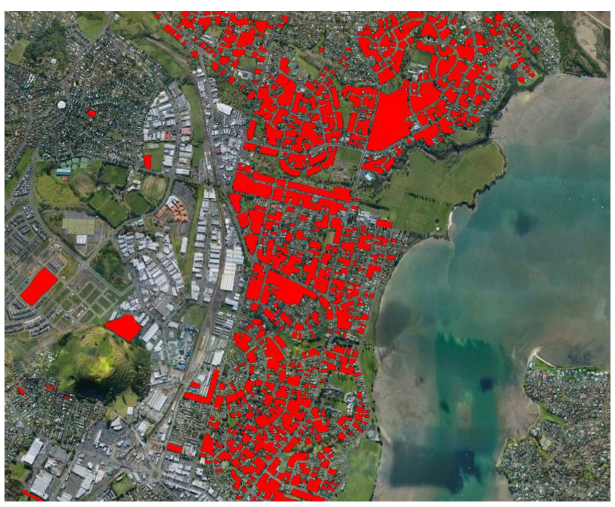
Crown-owned housing land http://transportblog.co.nz/2015/05/21/building-on-government-land/

There are clearly three big losers in this Bill. The people who walk around the Reserve and enjoy the open space, the people who use the sports grounds and lastly the birds. While well-intentioned, the Bill creates private profit at public and environmental loss. I am sure Ngāti Paoa deserve reparations, I would be more than happy for the Government to give the entire Reserve to Ngāti Paoa with the reserve status maintained, just like they have given many other conservation reserves to iwi. Iwi can be great conservation advocates. However where this Bill goes wrong is where it revokes the reserve status and rezones the Reserve from Public Open Space to Residential-Mixed Housing Urban. If Ngāti Paoa want the land to sell and make money I understand, I want them to have more money too. But I don't understand why the Government is making them pay for the land. Labour, Auckland Council and the Local Board think that Ngāti Paoa could be offered other land in the area. I don't know the details but I found this 2013 map of Crown-owned housing land in the area (above). There sure is a lot of it.