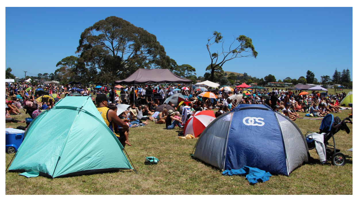
Music in the Parks, Point England Reserve January 2017.

I was surprised by the support I got. 1,848 people definitely do not help me with the dotterel or probably even bird watch at Point England. I definitely don't have that many friends on Facebook – so why do they care?