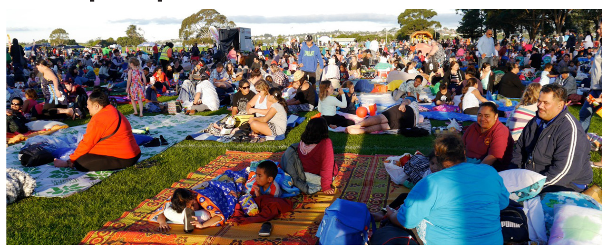
Movies in the Parks, Point England Reserve, March 2017.

I want to mention ecosystem services again. Point England provides what are called cultural ecosystem services. These are defined by the 2006 Millennium Ecosystem Assessment (MA) as "Nonmaterial benefits people obtain from ecosystems through spiritual enrichment, cognitive development, reflection, recreation, and aesthetic experiences".