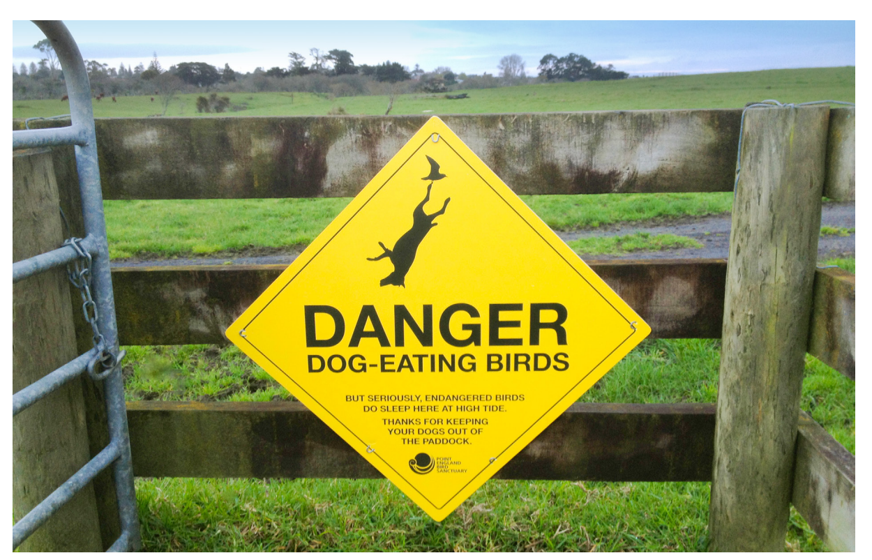
Humorous and effective conservation education signage at Point England Reserve

My first challenge when setting up the bird sanctuary was keeping the dogs out of the paddock. I had to be diplomatic about it because I needed to get the community on board. I put the time in talking to people and made this humorous sign (above). It worked really well and the dog walkers now police each other.