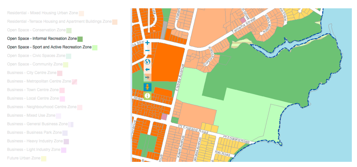
Unitary Plan Management Layers (zones) https://geomapspublic.aucklandcouncil.govt.nz

I think the Bill was just poorly researched and should now be thrown out. However I do understand how the mistake happened and I think more should be done at Point England to fix the perceptions of the Reserve. This should include better signage, lower impact grazing, nesting and roosting substrate trials and rezoning the Reserve in line with its current utility. It doesn't make sense to have Point England zoned for both sports and informal recreational when it has conservation-dependent birds. The informal recreational zone should clearly be a conservation zone.