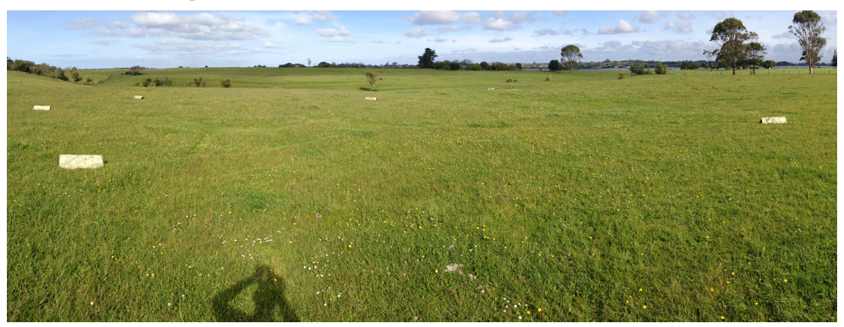
Chick shelters deployed at Point England 2014

Most of the media articles on the Bill have sympathised with the community loss of open space, especially the sports fields. However I have read two articles that accuse the community of nimbyism (Not In My Back Yard).