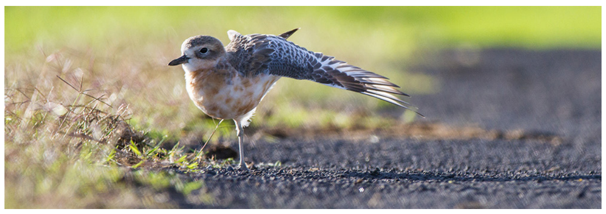
A Northern New Zealand dotterel stretches its wing at Point England

We know Aucklanders want to live with native birds, we love our tui so much but why should Aucklanders have dotterel?