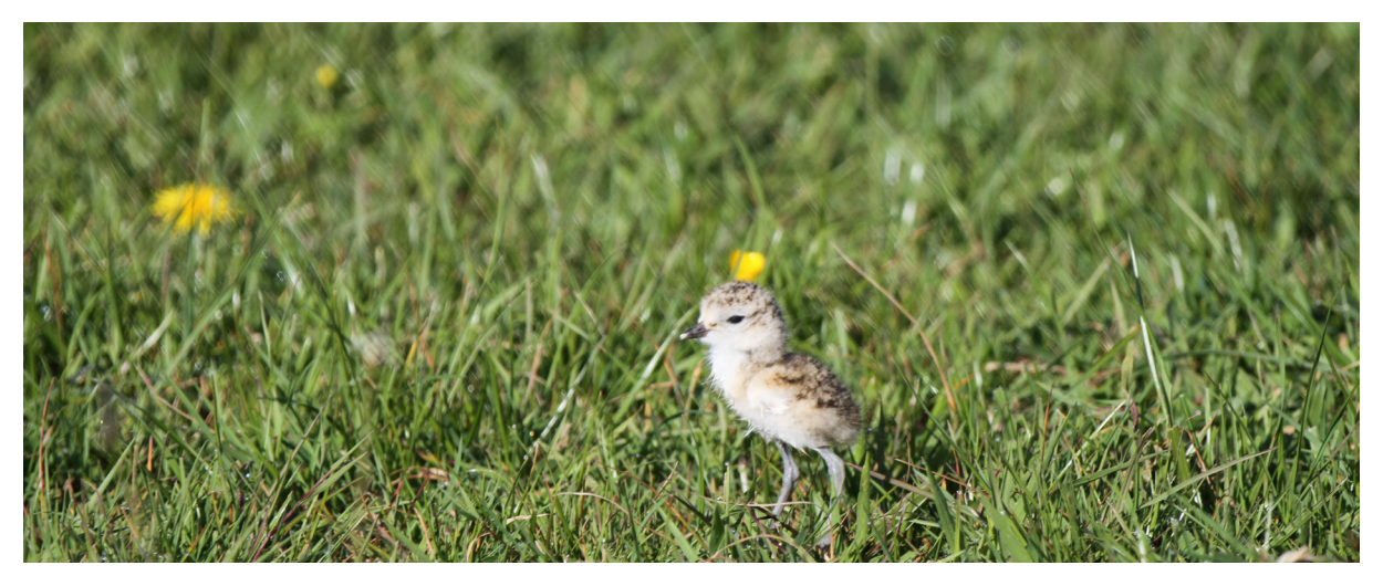
A Northen New Zealnd dotterel chick at Point England

Thank you for considering my petition to "stop the Point England Development Enabling Bill from proceeding until an independent environmental impact assessment has been completed and presented to the Local Government and Environment Committee with a better development proposal."