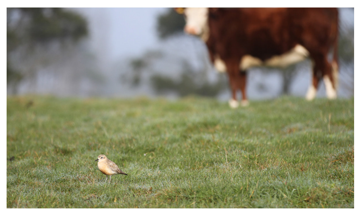
A Northen New Zealand dotterel and livestock at Point England

In 2015 when Nick Smith was examining all Crown-owned land in Auckland for possible housing development, he said there were "very precious nature reserves" which would never be considered for sale. When MBIE officials looked at Point England they just saw cows. This is understandable given Northern New Zealand dotterel are very small or they may have visited at low tide when all the roosting shorebirds birds are feeding in the estuary. But the fact is the Reserve is used by ten times more shorebirds than cows. It's not just the abundance of endangered birds that makes the Reserve eligible for Ramsar status but also just how endangered some of them are.