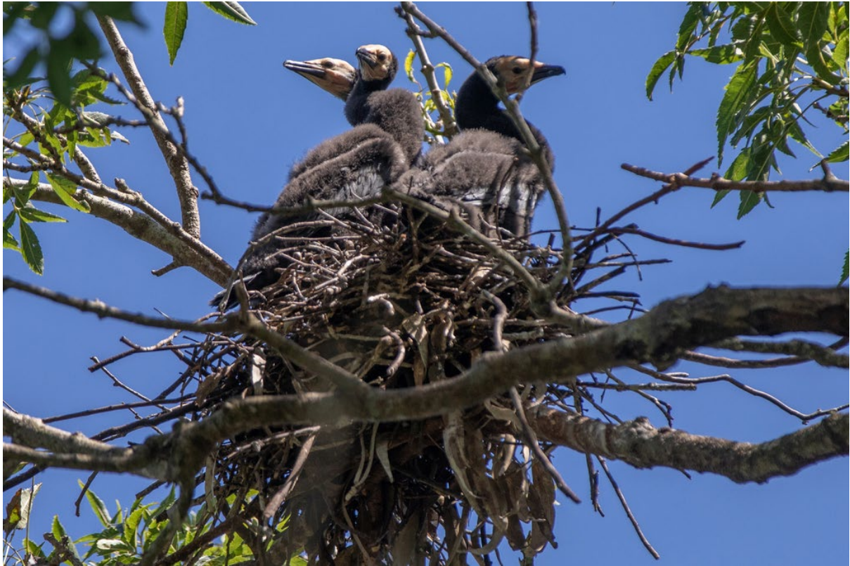
Kawaupaka chicks above the stormwater pond at Point England.

Under the Resource Management Act 1991 and the National Policy Statement for Indigenous Biodiversity (NPSIB) 2023, Auckland Council has a clear legal obligation to protect significant habitats of indigenous fauna and ensure "no overall loss" of regionally threatened species.