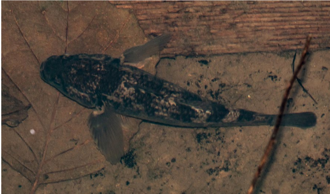
Giant Bully (Gobiomorphus gobioides) in Maybury Reserve May 2019.

Of particular significance is the largest colony of Kawaupaka (New Zealand Little Shag) Microcarbo melanoleucos ssp. Brevirostris in the Auckland region. This species is regionally endangered 6 . The colony uses exotic trees around the Point England stormwater pond which are threatened by the redevelopment of the pond.