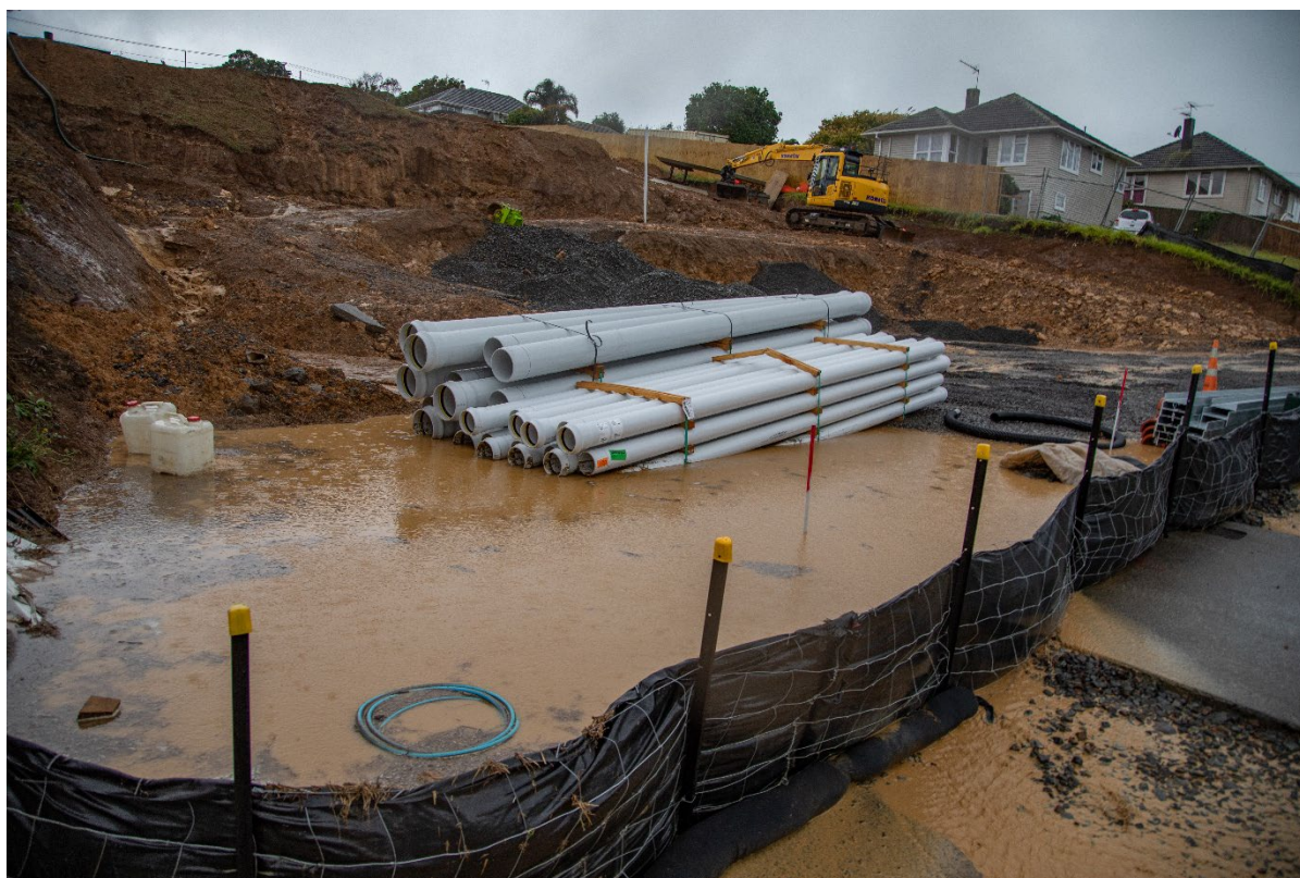
A 'leaking' building site in Auckland.

We note with significant concern that the new Bills do not include any references to the Hauraki Gulf Marine Park Act 2000 or the recently passed Hauraki Gulf/Tikapa Moana Marine Protection Act 2025. The Hauraki Gulf is a highly depleted and stressed environment that requires integrated management across land and sea boundaries. Failing to acknowledge these specific statutory protections creates legal uncertainty and risks further degradation of one of New Zealand's most valued marine areas.