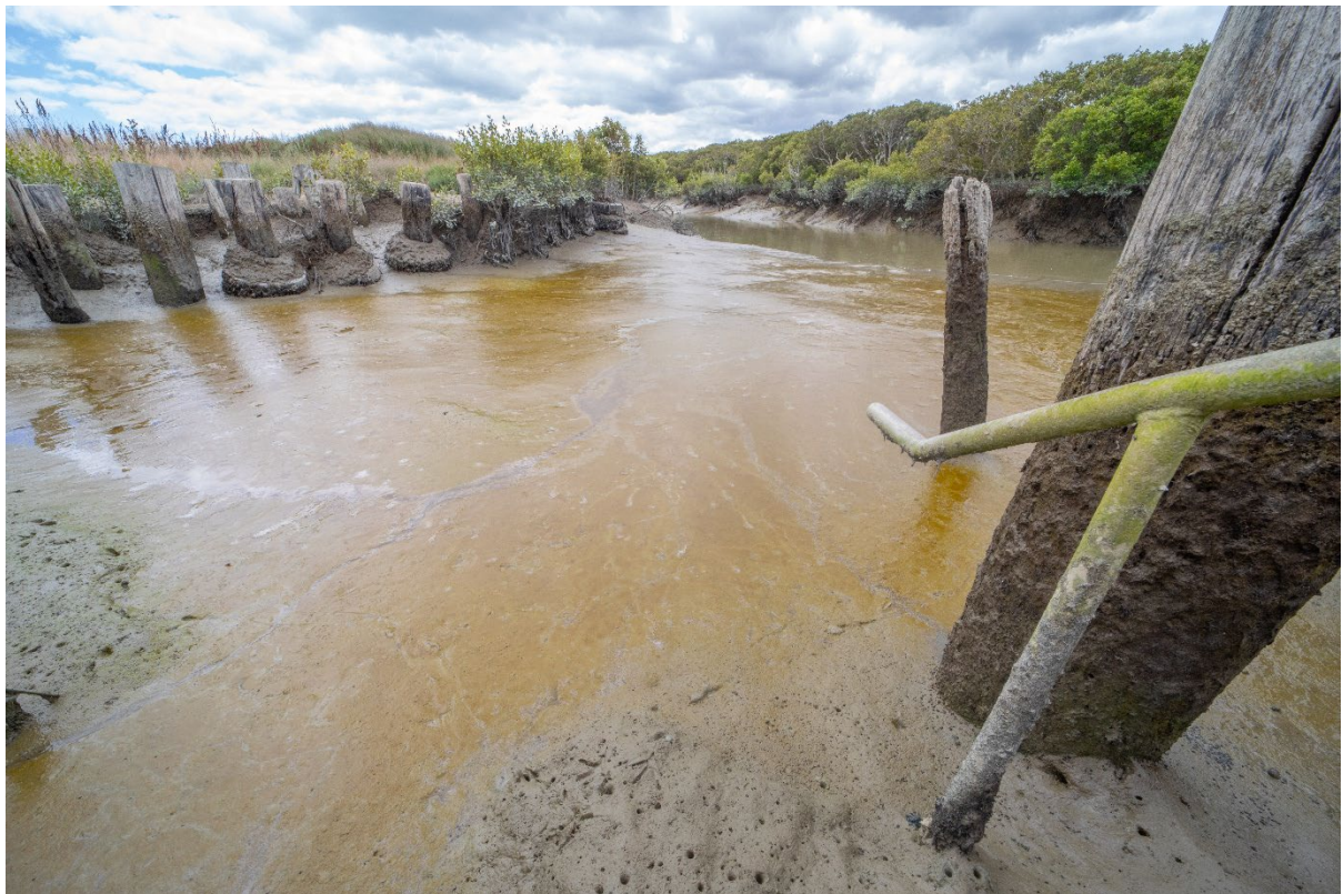
Sediment in the Piako River, Waikato Region.