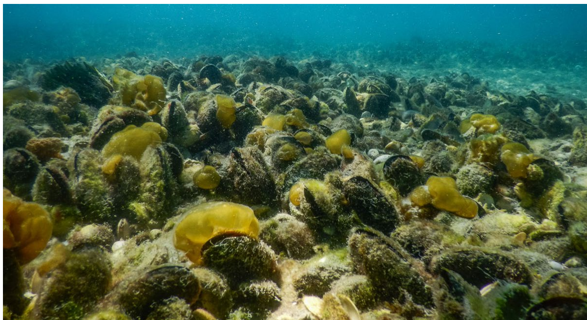
Image taken onsite January 2018 https://blog.shaullee.co.nz/natural-mussel-recruitment

We support Patuharakeke Hapū's request to extend the Section 186A Closure on Mair and Marsden Banks, Marsden Point to the harvesting of ALL SHELLFISH.